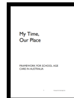
My Time, Our Place; Framework for School Age Care in Australia

Critical reflection: reflective practices that focus on implications for equity and social justice ( Early Years Learning Framework – refer to Sources ).